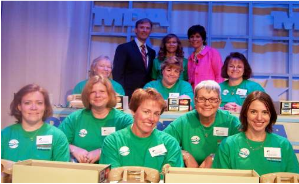
9 members volunteered on Monday 9/1 to answer phones at the MDA telethon.