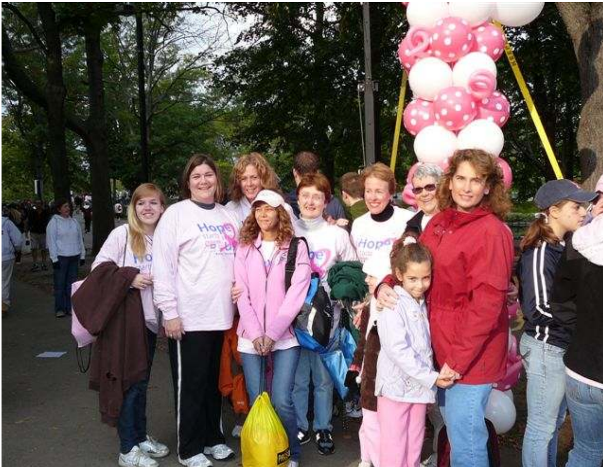
6 members, and some friends and family, walked on Sunday 10/5 in the 2008 Making Strides Against Breast Cancer along the Charles River.