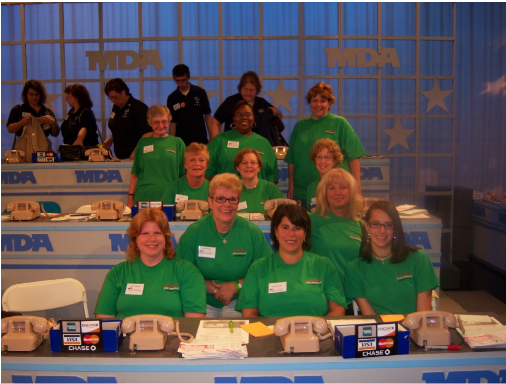
11 members volunteered on Monday 9/3 to answer phones.